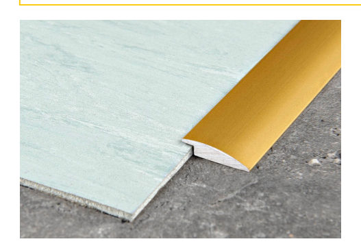
ANODIZED GOLD AND SILVER ALUMINIUM thermo packed har length 2 7 lm - nack 40 Pcs - 108 lm

ANODIZED GOLD AND SILVER ALUMINIUM WITH AND WITHOUT SELF-ADHESIVE