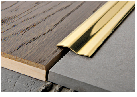
POLISHED BRASS self-adhesive thermo packed bar length 2,7 lm - pack. 40 Pcs - 108 lm

SUITABLE FOR USE IN CONTACT WITH FOODSTUFFS. On demand hand-brushed stainless steel (Price to be agreed. Production delay 4/5 weeks)