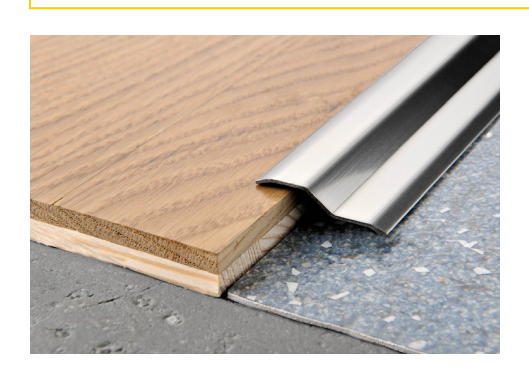
POLISHED STAINLESS ST. AISI 304/1.4301-V2A self-adhesive thermo packed - bar length 2,7 lm - pack. 40 Pcs - 108 lm

POLISHED STAINLESS STEEL AISI 304/1.4301 AND POLISHED BRASS WITH SELF-ADHESIVE