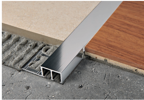
ANODIZED ALUMINIUM thermo packed bar length 2,7 lm - pack. 40 Pcs - 108 lm

1. Choose "PROFINLIST 20" according to the width and desired finish. 2. Cut "PROFINLIST 20" to the desired length and apply the adhesive on the support where the profile will be laid. 3. Press the anchoring flange of "PROFINLIST 20" into the adhesive. 4. Lay the tiles, aligning them with the profile leaving a 2 mm joint. Remove immediately all remains of adhesive from the surface of the profile. 5. Fill the joints between the profile and the tiles with grout, in order to avoid water stagnation. Remove immediately all the remains of grout from the surface of the profile.