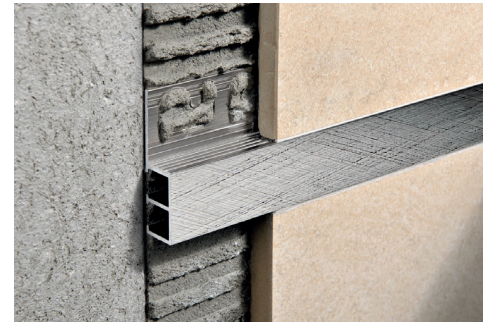
POLISHED ALUMINIUM thermo packed bar length 2,7 lm - pack. 40 Pcs - 108 lm