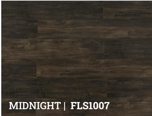
MIDNIGHT | FLS1007