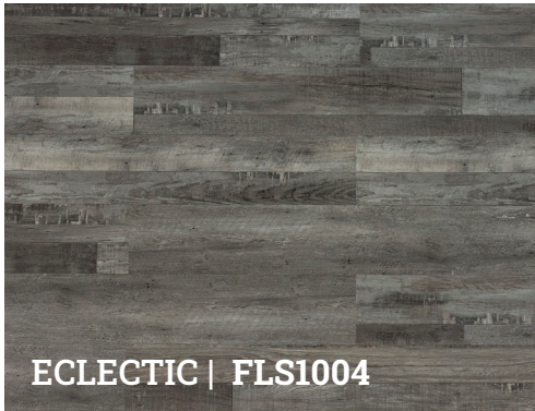
ECLECTIC | FLS1004