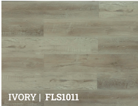
IVORY | FLS1011