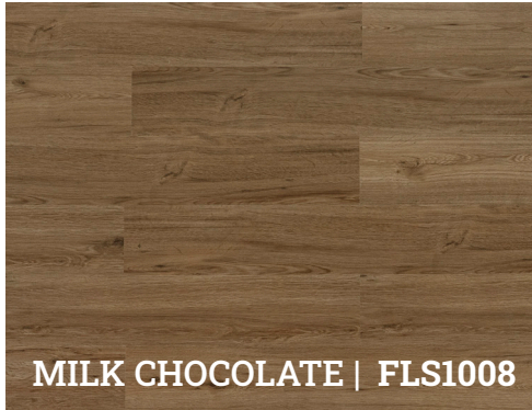
MILK CHOCOLATE | FLS1008