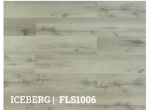
ICEBERG | FLS1006