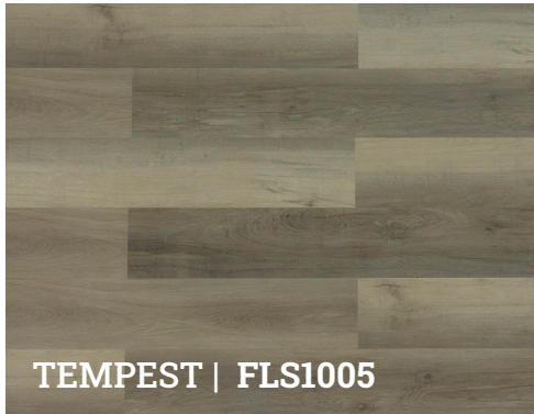
TEMPEST | FLS1005