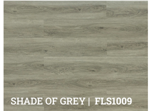
SHADE OF GREY | FLS1009