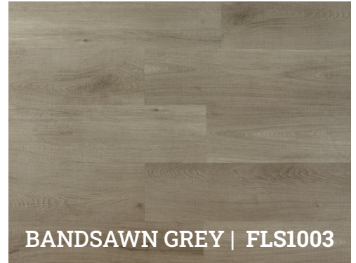
BANDSAWN GREY | FLS1003