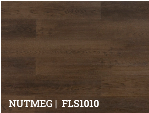
NUTMEG | FLS1010