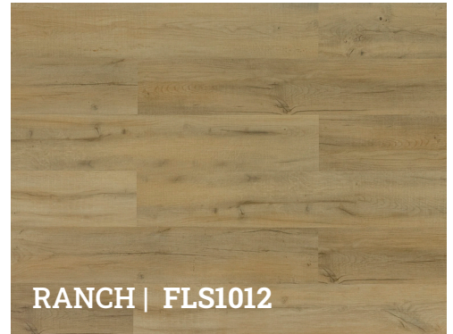
RANCH | FLS1012

6895 PACIFIC CIRCLE, MISSISSAUGA, ONTARIO, L5T 2H3, CANADA