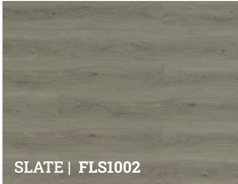
SLATE | FLS1002