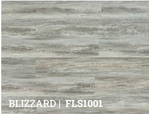
BLIZZARD | FLS1001